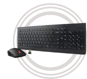
Lenovo 510 Wireless Combo Keyboard & Mouse

* Example of Lenovo IdeaCentre AIO catalogue naming convention