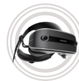
Lenovo Explorer Immersive Headset