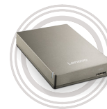
Lenovo UHD F309 USB 3.0 2 TB